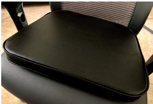
Looped Seat Cushion